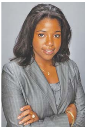
By Patricia Elizée, Esq

On December 27, 2012, U.S. Citizenship and Immigration Services (USCIS) announced that there will be another extension of the re-registration period for Haitian nationals who have already been granted Temporary Protected Status (TPS) and seek to maintain that status for an additional 18 months. USCIS will accept applications until January 29, 2013!