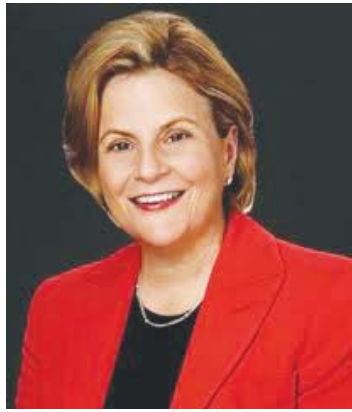
Congresswoman Ileana Ros-Lehtinen of Miami, voted YES

Among Republicans, 14 Florida House members voted against the deal, bucking their party's leadership. So did GOP Sen. Marco Rubio. The House members included Gus Bilirakis of Palm Harbor, Richard Nugent of Brooksville and Dennis Ross of Lakeland.