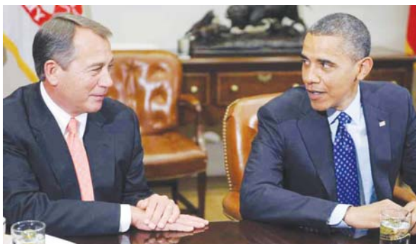
Congressman John Boehner et Président Barack Obama

WASHINGTON -- L'année 2013 aurait pu commencer de plus mauvaise manière. L'accord intervenu mardi 1er janvier, à Washington, sur le budget américain évite une catastrophe. Il faudrait être un esprit bien chagrin pour ne pas s'en féliciter. Si démocrates et républicains ne s'étaient pas