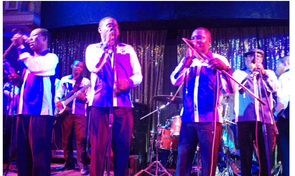
L'Orchestre TROPICANA lors de sa prestation le samedi 1er décembre 2012, à Tatiana Night Club, Hallandale Beach.

Au commencement, il n'y avait pas beaucoup de musiciens à gérer, explique M. Antoine. Aujourd'hui, c'est plus complexe dit-il. Il y a les retraités, les musiciens actifs et les stagiaires. Maintenant le Tropicana est une machine avec plus de deux cent (200) contrats de bals et de ker-