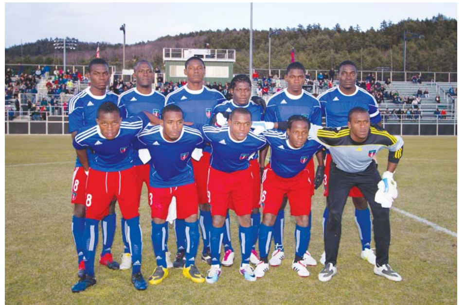
Les Grenadiers (39e) dans le dernier classement mondial de la FIFA doivent reprendre les séances d'entraînement le lundi 7 janvier 2013. Ils affronteront la sélection chilienne le 19 janvier à Concepcion.