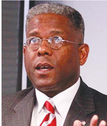
Congressman Allen West of Palm Beach Gardens, voted NO