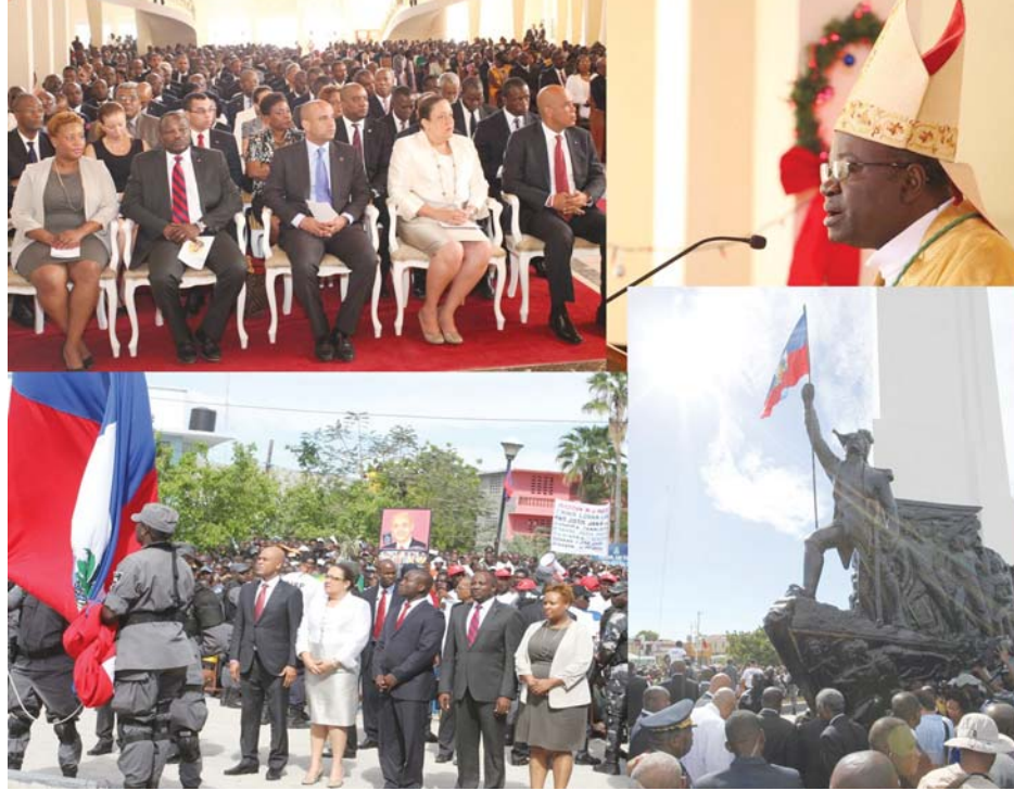
On Tuesday, January 1, 2013, Haiti celebrated 209 years of independence.

Happy New Year 2013 From The Publisher! PAGE 3