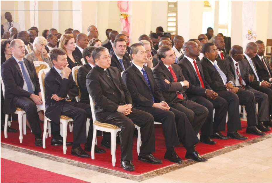
View of the participants at the Cathedral St. Charles Borromée of Gonaïves. Haiti Marks 209 Years of Independence, Jan. 1, 2013.