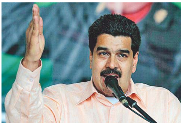
Actuel ministre des Affaires étrangères et vice-président du Venezuela, Nicolas Maduro a été désigné par Hugo Chavez comme son successeur.

Le second prétendant possible est Elias Jaua. Prédécesseur de Nicolas Maduro au poste de vice-président, Hugo Chavez l'a envoyé au "casse-pipe" en lui demandant de se présenter à l'élection de gouverneur de l'État de Miranda contre le candidat malheureux de l'opposition à la présidentielle, Henrique Capriles. Si ce dernier a gagné, le score obtenu par le candidat chaviste est