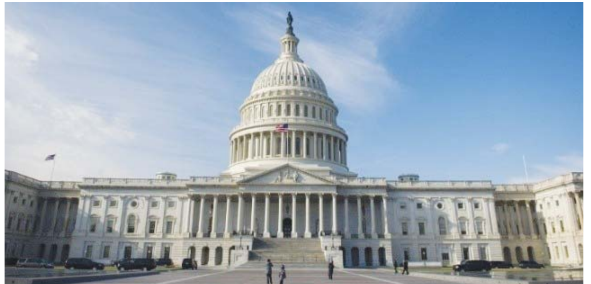
Si démocrates et républicains ne s'étaient pas entendus au Congrès, les Etats-Unis risquaient de rechuter dans la crise

"Nous nous réjouissons des mesures prises par le Congrès américain pour empêcher des hausses d'impôts et des réductions des dépenses publiques