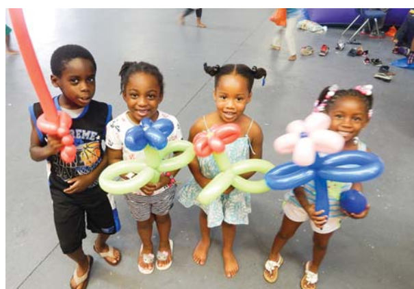
Kids enjoy their shaped balloons