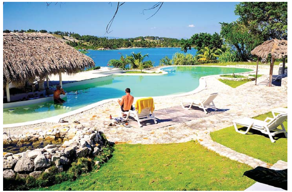
Abaka Bay Beach, on Haiti's Ile-à-Vache. A remote beach on the island of Ile-a-Vache, off of the Southern Coast of Haiti, ranked 57th on CNN's World's 100 best beaches report, which is another sign of Haiti's growing tourism sector and a boost for a government initiative to turn the island into a major tourism destination.

And this past April Hilton Worldwide (HLT) signed an agree-