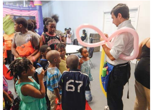
The kids enjoyed some fun with shaped balloons