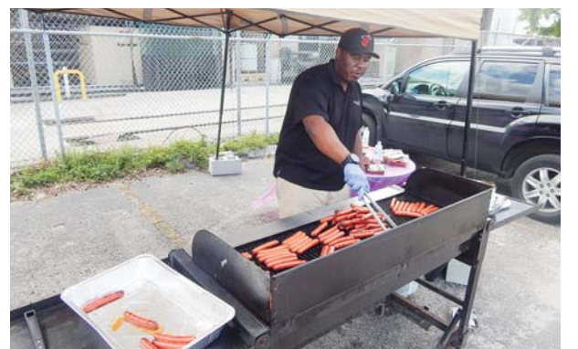
Grilled Hot Dog lunch were provided to the kids