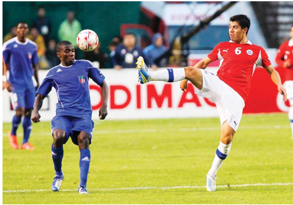
Une phase de la rencontre Haïti vs Chili le 19 janvier 2013 au stade Municipal (Conception), Chili.

Haïti et le Chili se sont déjà affrontés six fois. Au terme de ces six confrontations, chacune des deux équipes comptent deux victoires, deux défaites et deux nuls. Leur dernier duel remonte au 19 janvier 2013 où le Chili avait battu les grenadiers sur un score de 3 buts à 0 au stade Municipal (Conception), Chili. Le match prévu pour le mois