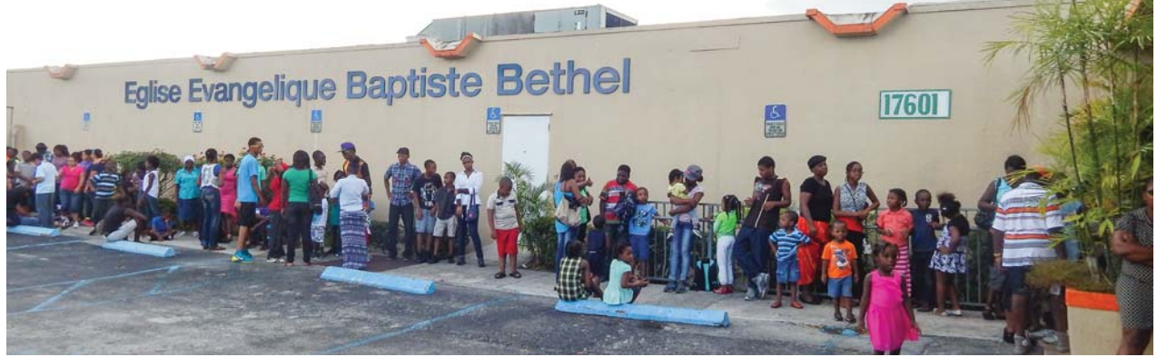
Participants had formed a long line outside the "Eglise Evangelique Baptiste Bethel" waiting patiently