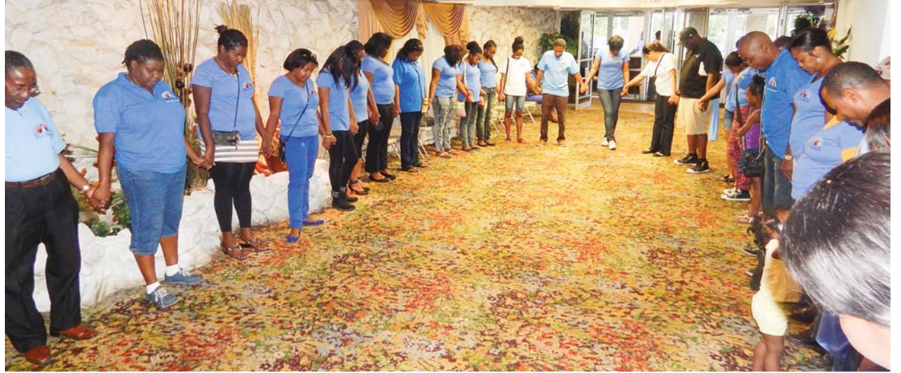
Back-to-School Health Staff members gather in prayer before the fair begins