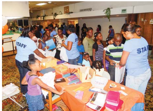
Families line up to receive free school supplies.