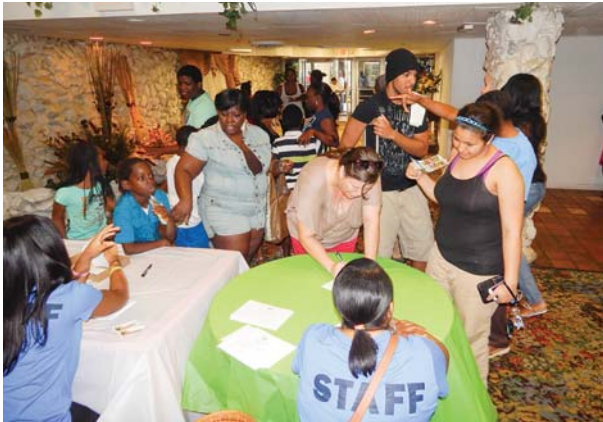
All participants were asked to fill out the registration form