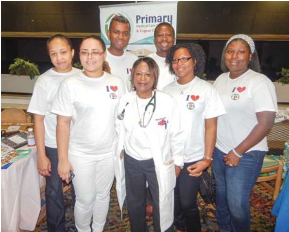
Seven staff members of Primary Medical Center