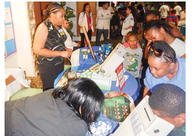
Without good vision children can enormous setbacks to learn and the development of all their skills.