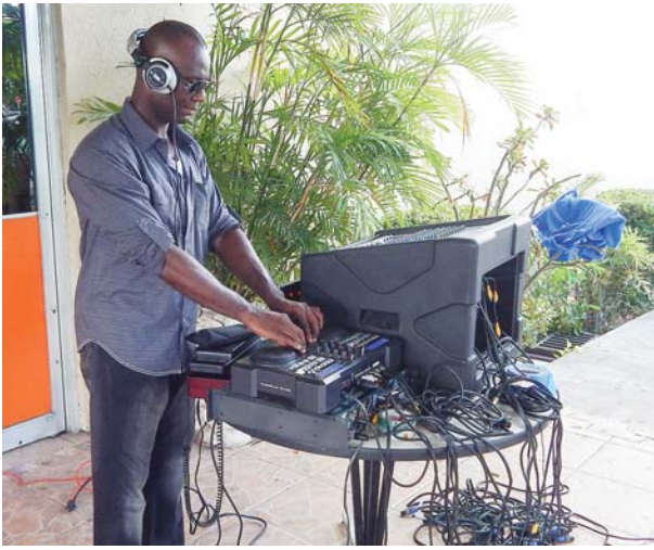
He did a great job by focusing on the quality of his music