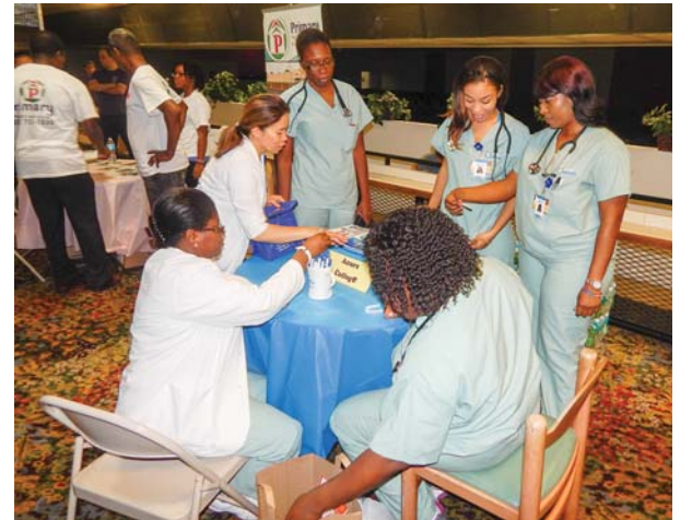
Six members of Azure College School of Nursing