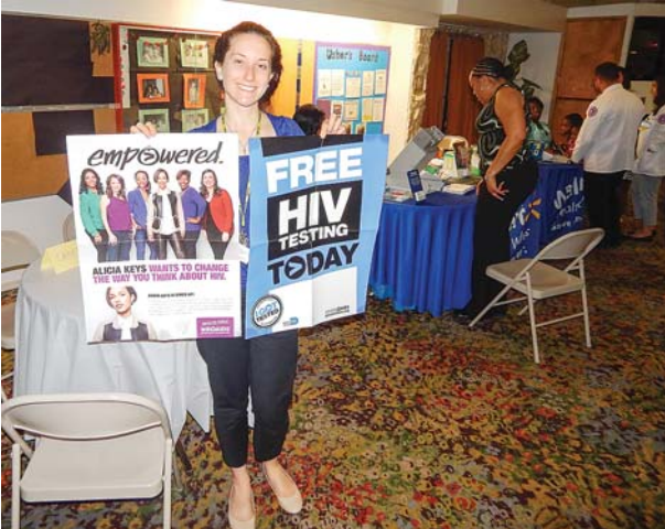
She encourages HIV testing