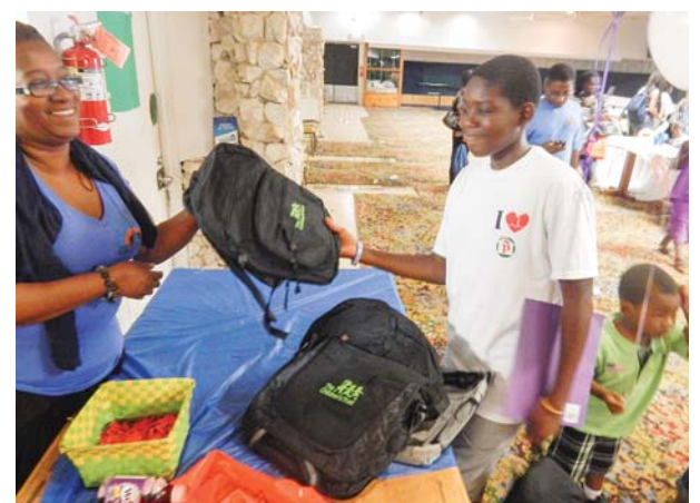
Staff member hand out a bag to a boy during the Back-To-School Health Fair

sons. Some were there for the HIV screening, vision test, glucometer, hearing test, cholesterol screening, and more. Free flu vaccines were also administered to children at this event.