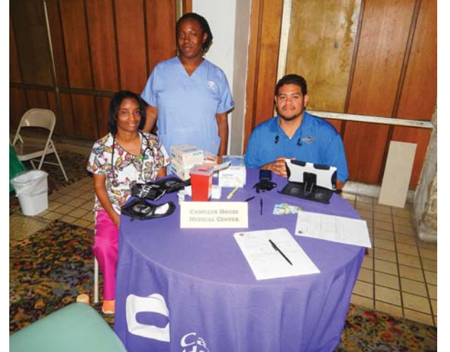
Three members of Camilus House Medical Center