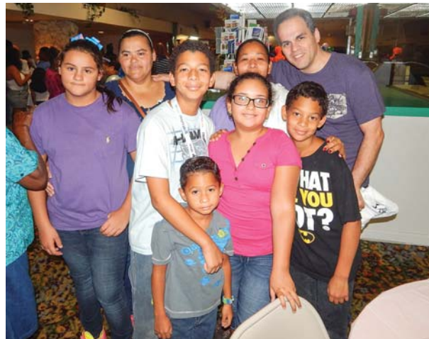
Hundreds of parents and kids attended the fair