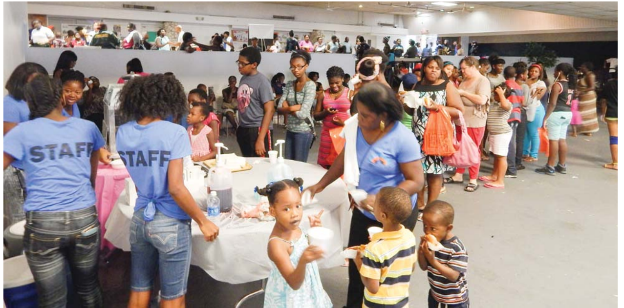
The fair was open to everybody, not only Haitians.

He went on to state, "This fair has always been a success, but this year we were amazed by the presence of more people from other ethnic groups aside from Haitians. We had Jamaicans, Afro-Americans, and Spanish people here. Thanks to the radio station HOT 101 for promoting this event free of charge."