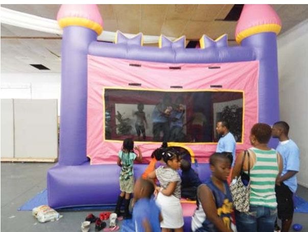
Kids enjoy the bounce house at the fair