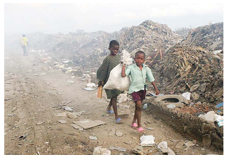
The process melts down plastic into a material that serves as a replacement for lumber.

Whether it will happen depends on whether the stu-