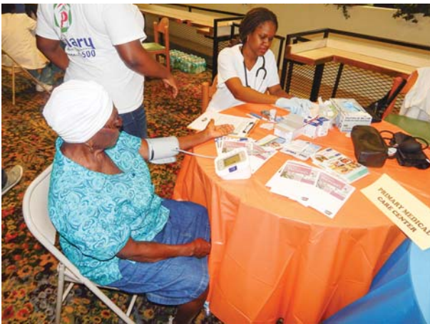
Every health care visit should include a blood pressure reading