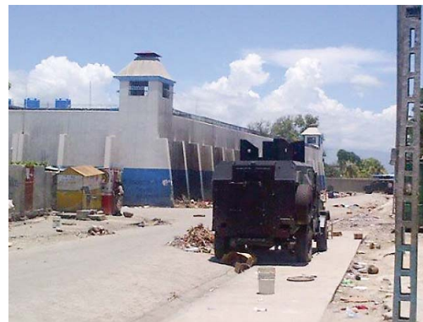
Un véhicule blindé de l'unité S.W.A.T. sur la cour de la prison civile de Croix-des-Bouquets.

Le système judiciaire haïtien est gravement malade. La détention préventive prolongée est un