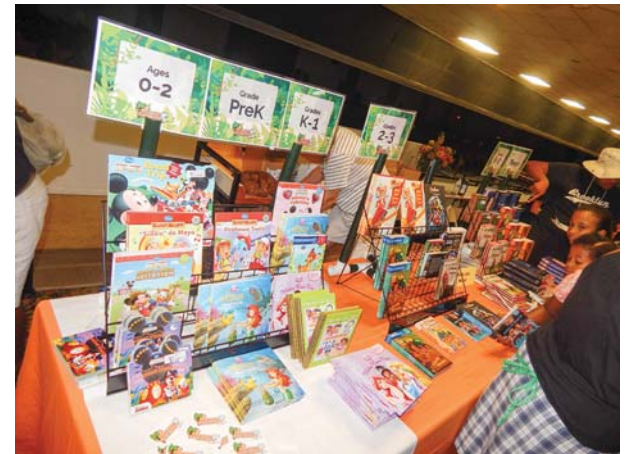
Over 1000 free books were given away at the Back-To-School Health Fair at Bethel Evangelical Baptist Church.

A wide range of participants of all ages attended the Back to School Health Fair, each for different rea-