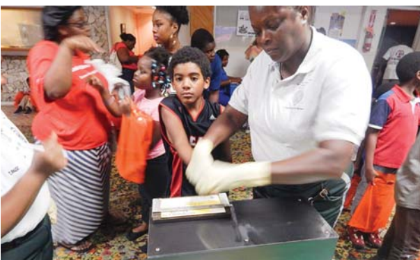
Medical professionals from Primary Medical Center and other partner entities expressed their satisfaction to volunteer at this great event.