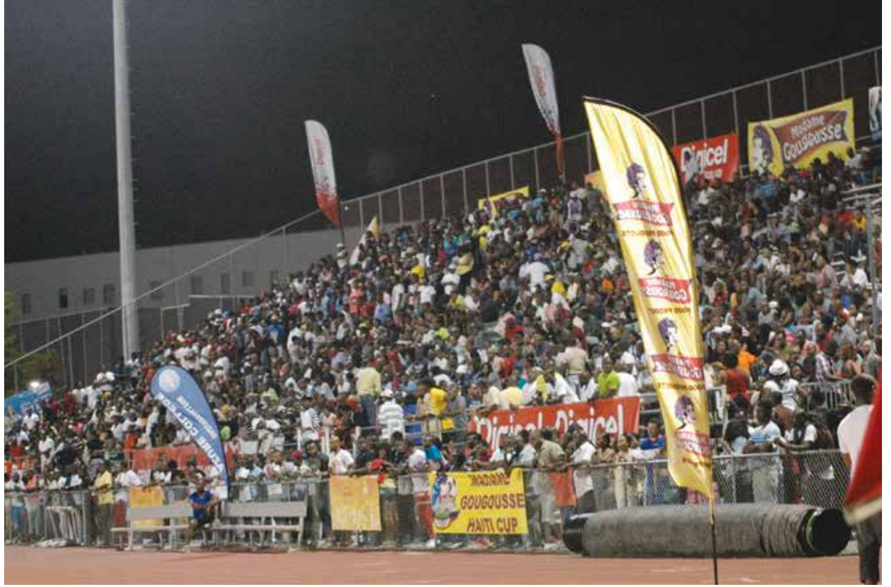
Les organisateurs espèrent battre un record de spectateurs à l'occasion de la soirée de clôture de la première édition de "Super 8 Cup" prévue pour le dimanche 11 septembre 2016. La grande finale opposera les équipes Gonaïves et Violette. Les formations compas KLASS et dISIP animeront la partie musicale.

Si traditionnellement la dernière journée attire toujours un public nombreux, les organisateurs espèrent battre un record de spectateurs la soirée du dimanche 11 septembre, compte tenu du fait que les deux formations musicales retenues pour ambiancer le public regroupent en leur sein des musiciens de renom, particulière-