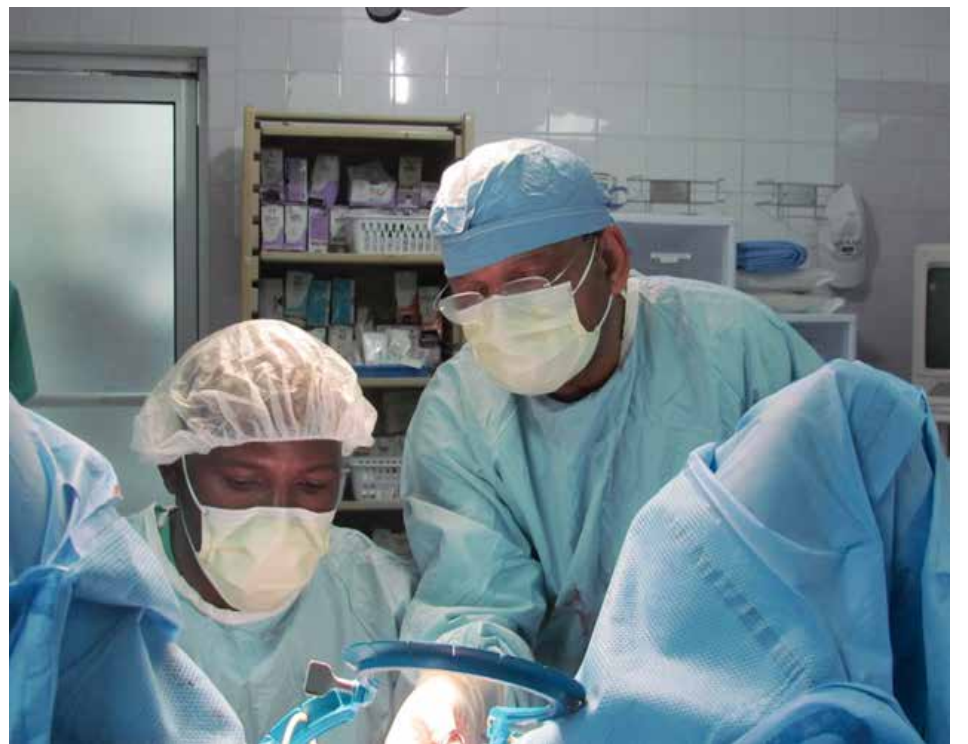
Teaching Residents a Key Priority