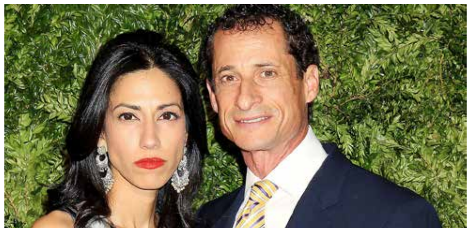
La conseillère d'Hilary Clinton, Huma Abedin, et son 'ex-époux', l'ex député démocrate Anthony Weiner.

Publiées dimanche soir, les photos ont provoqué un tollé dans le