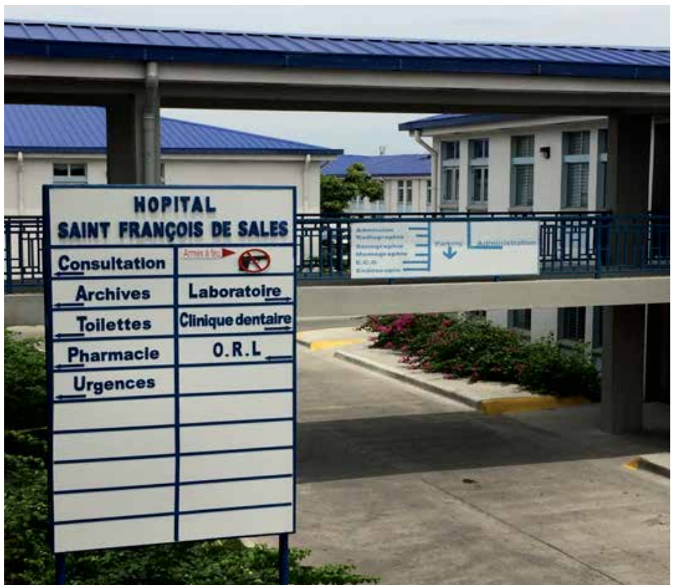
University Hospital St Francois de Sales 190 Beds Modern Hospital in Port-au-Prince