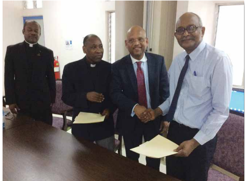
Official Signature of the Urology Memorandum of Understanding

Future GASHU Conference at Karibe Hotel (October 29-30, 2016) where many International and Haitian Urologists and residents will be presenting their clinical and academic experience in Urology during the two day confer-