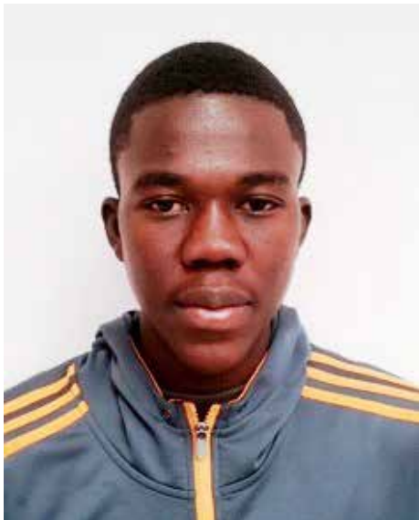
Haitian-Dominican Luisito Pie won the bronze in the 56 kilogram men's taekwondo in Rio