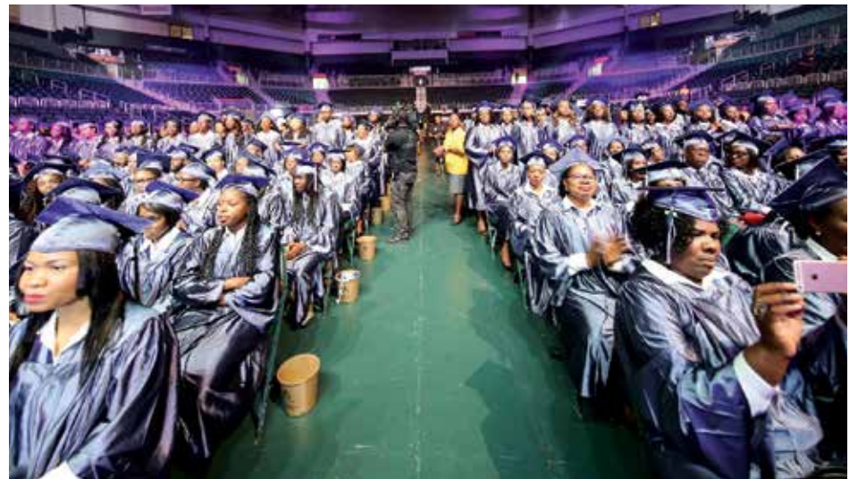
Les 300 nouveaux membres de TG

À noter que quelques membres du campus du Tabernacle de Gloire en Haïti ont pu faire le déplacement du Cap-Haitien à Miami le samedi 30