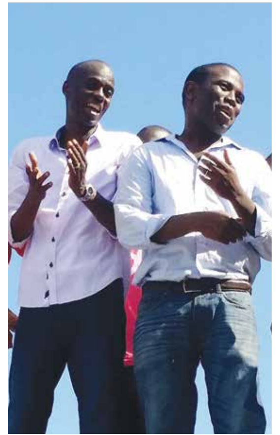
Jovenel, candidat à la présidence du Parti haïtien tèt kale (Phtk) et Guy Philippe, candidat au Sénat pour le département de la Grande Anse (une partie du Sud-Ouest) du Consortium lors d'un rassemblement politique à Jérémie en 2015.

« Le Cep ne travaille pas avec les rumeurs, mais se base plutôt sur la loi, sur les textes de lois et les règlements, qui existent en la matière », renchérit la porte-pa-