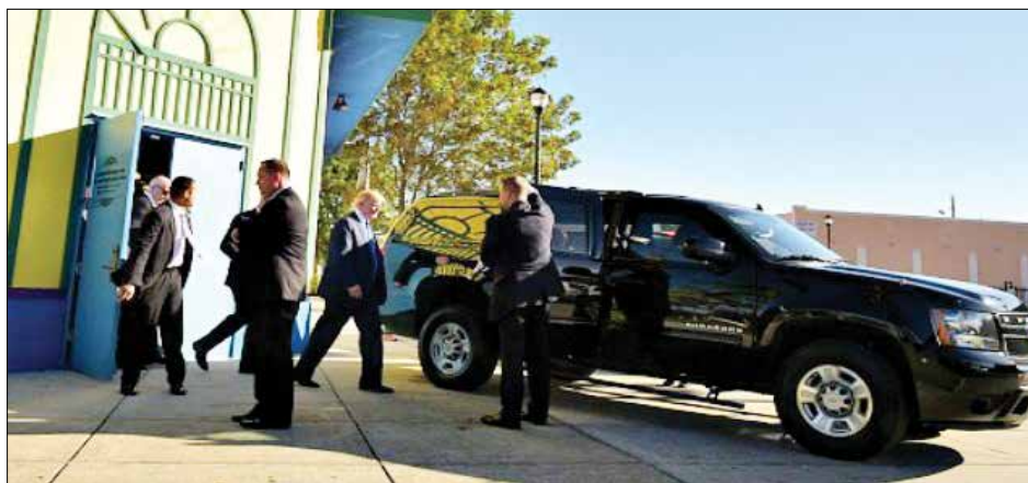
US Presidential candidate leaves the Caribbean Market Place in Little Haiti on Friday, September 16, 2016, after meeting with members of the Haitian Community.