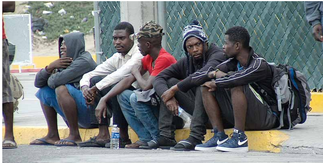
A group of Haitians on the way to the U.S. sits on a curb in Tijuana, Sept. 20, 2016.

With the full resumption of deportations, which took effect on Thursday morning, Haitians who arrive at the